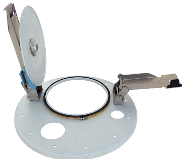
Cover position: unsealed, opened